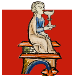
Milly's Small Beers

To celebrate the return of Spring and the promise it brings, entrants are encouraged to find ways to incorporate themes of Spring into their entries - be they agricultural tools to prepare for a Summer bounty, cheerful dishes to eat in the warming sun, new boots for walking in or an embroidered piece to admire.