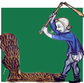
For the Field