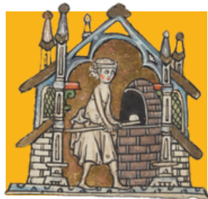
For the Home