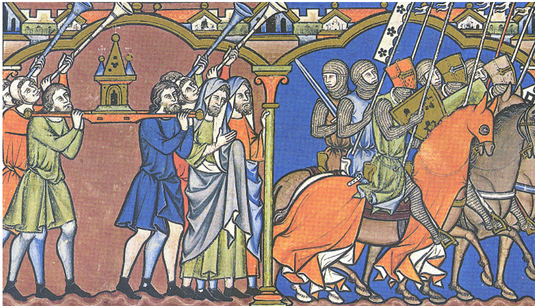
The Ark of the Covenant

the Turks invading Europe. Shah Abbas ordered that Persian descriptions of the scenes were added to the margins. They are not translations of the Latin text; instead they are Persian interpretations from eastern point of view.