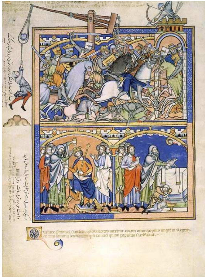
Saul Slaying Nahash and the Ammonites and Samul Anoints Saul and the Sacrifices to the Lord.

Maciejowski (1548-1608) who then sent it as a gift to Abbas I (1571-1629), King of Persia in 1608. This was a peace-giving gift ordered by Pope Clement XIII, to secure an alliance with Shah Abba who would be able to provide troops against