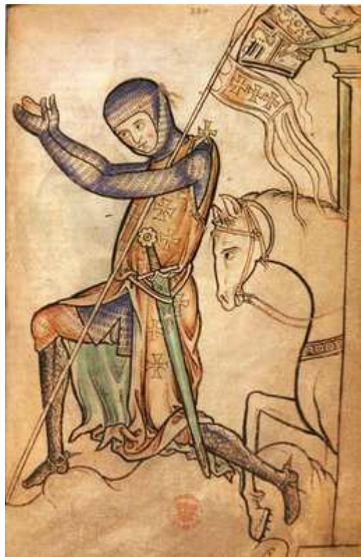
Kneeling Knight, Westminster Psalter, London, c. 1250