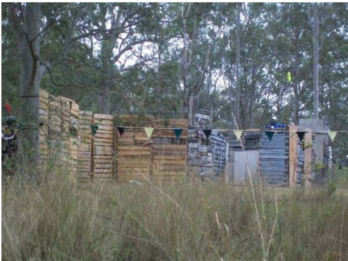
The Spring War Fort – what's a war without battlements?